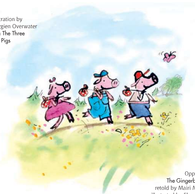
Illustration by Georgien Overwater from The Three Little Pigs

Opposite: from The Gingerbread Man , retold by Mairi Mackinnon, illustrated by Elena Temporin